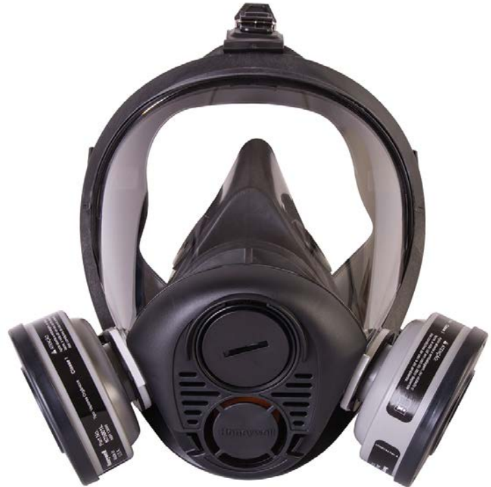
North RU6500, shown with North N-Series Organic Vapor cartridges. Filters and cartridges sold separately.

The RU6500 Series with 4-point headnet easily accommodates other personal protective apparel such as a hardhat or earmuffs.