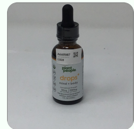
The photos on this report are of a sample collected by the lab and may vary from the final packaging.