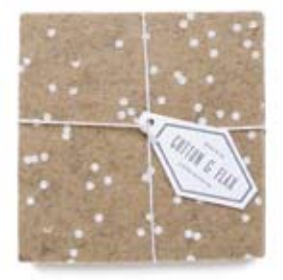
C - 004 LATTE CONFETTI