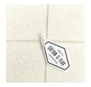
C - 012 WHITE CONFETTI