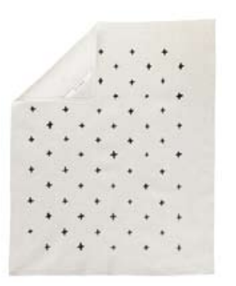
T - 007 BLACK PLUS