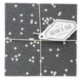
C – 006 CHARCOAL CONFETTI