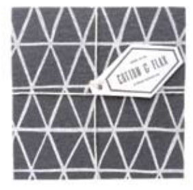
C - 007 CHARCOAL TRIANGLE