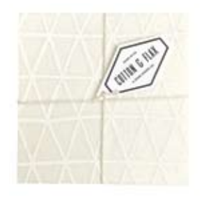
C - 011 WHITE TRIANGLE