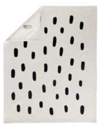
T - 001 BLACK BRUSHSTROKE