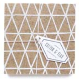
C - 005 LATTE TRIANGLE