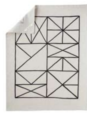
T - 010 GRID