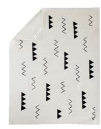
T - 008 ZIG ZAG