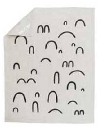
T - 009 HILLS + VALLEYS