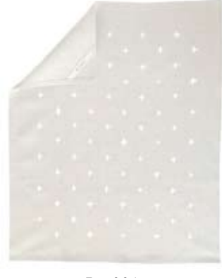
T - 006 WHITE PLUS