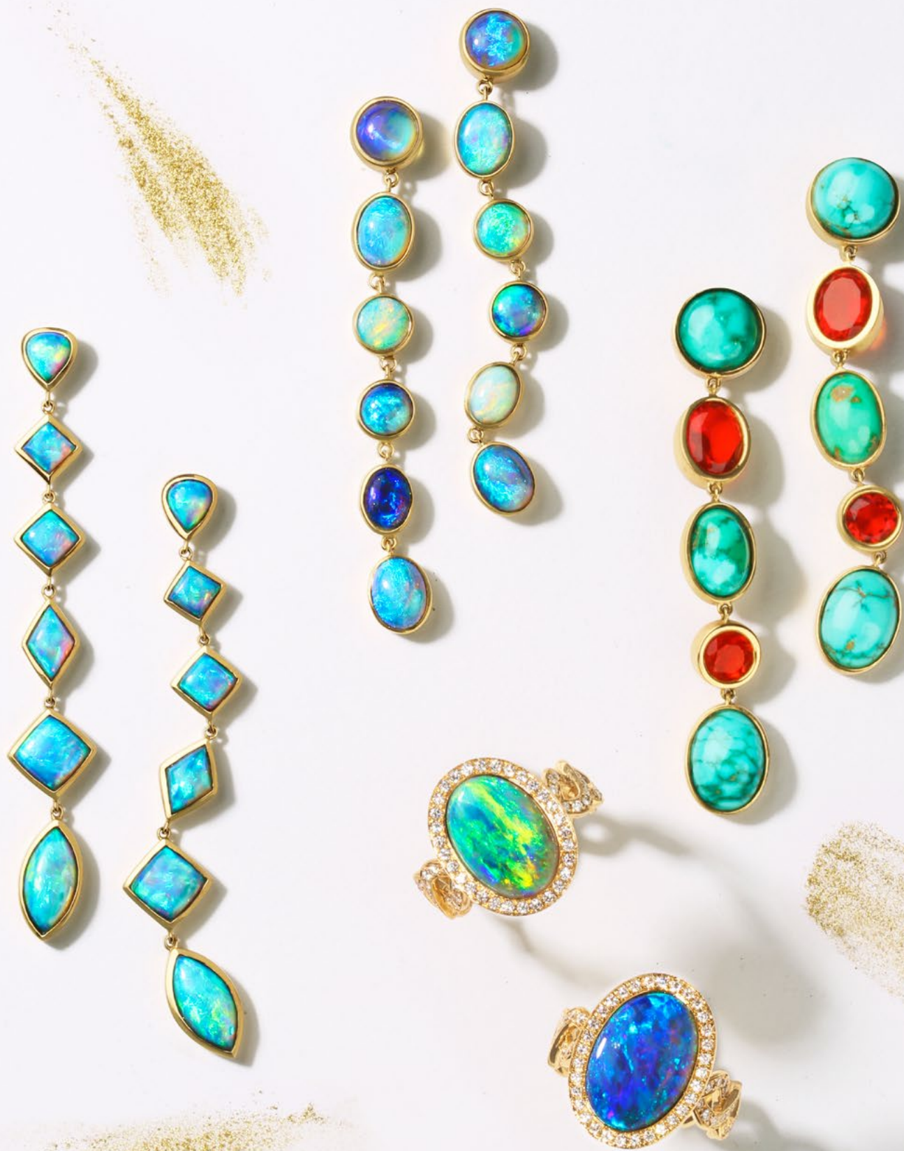
Classic black opal drop earrings bezel set in 18k gold; turquoise and fire opal drop earrings; classic opal cocktail rings with diamond accents set in 18k gold.