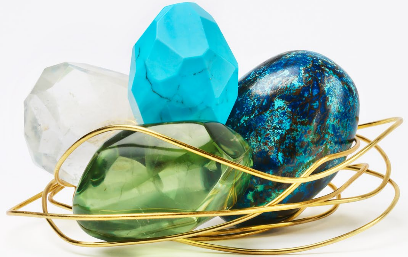
Cage pendant loose interchangeable stones available in quartz, turquoise, boulder opal, purple and green amethyst, rose quartz, and morganite