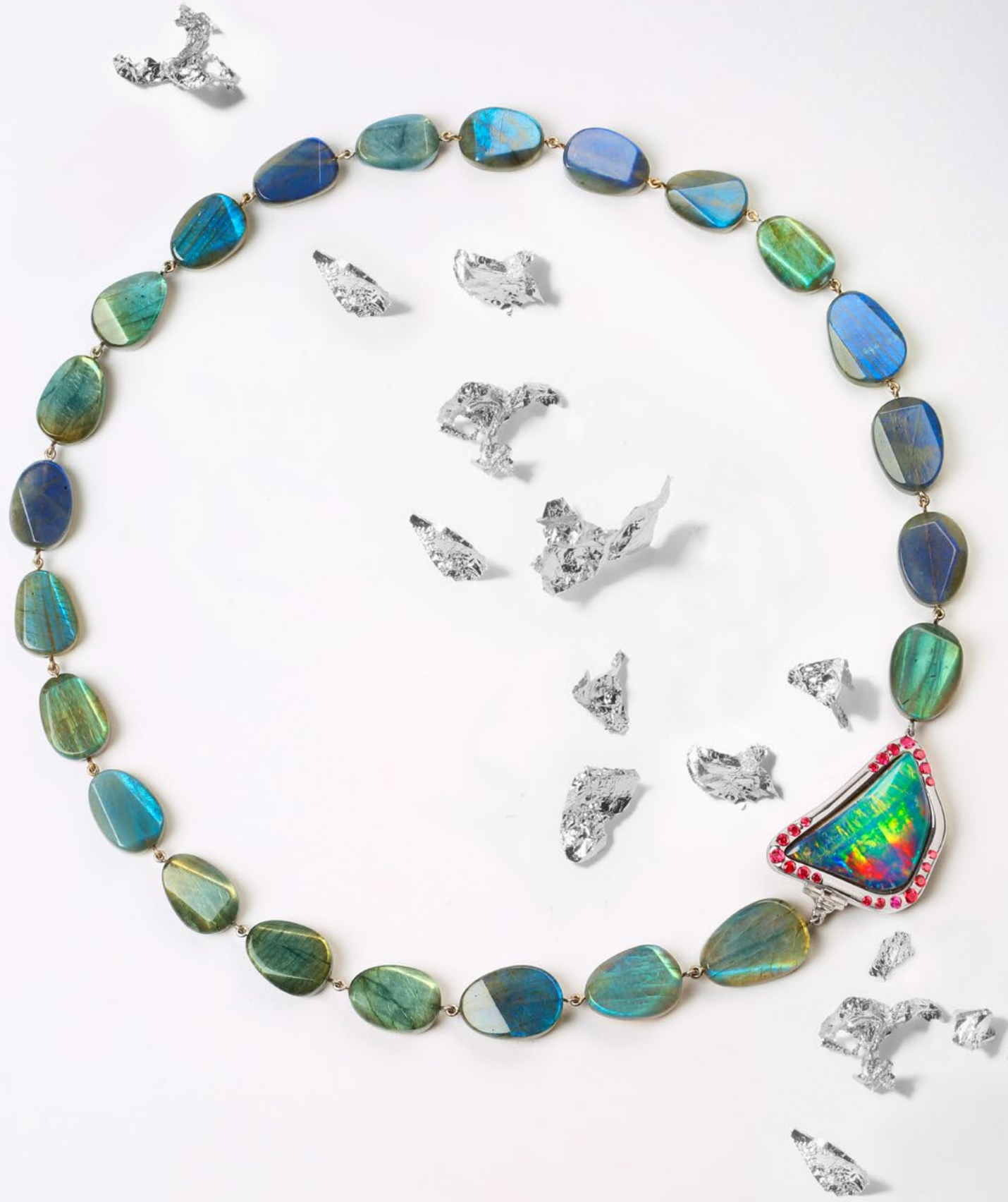
6 Opal and labradorite necklace with 28.52ct boulder opal set in 18k white gold with red spinel accents