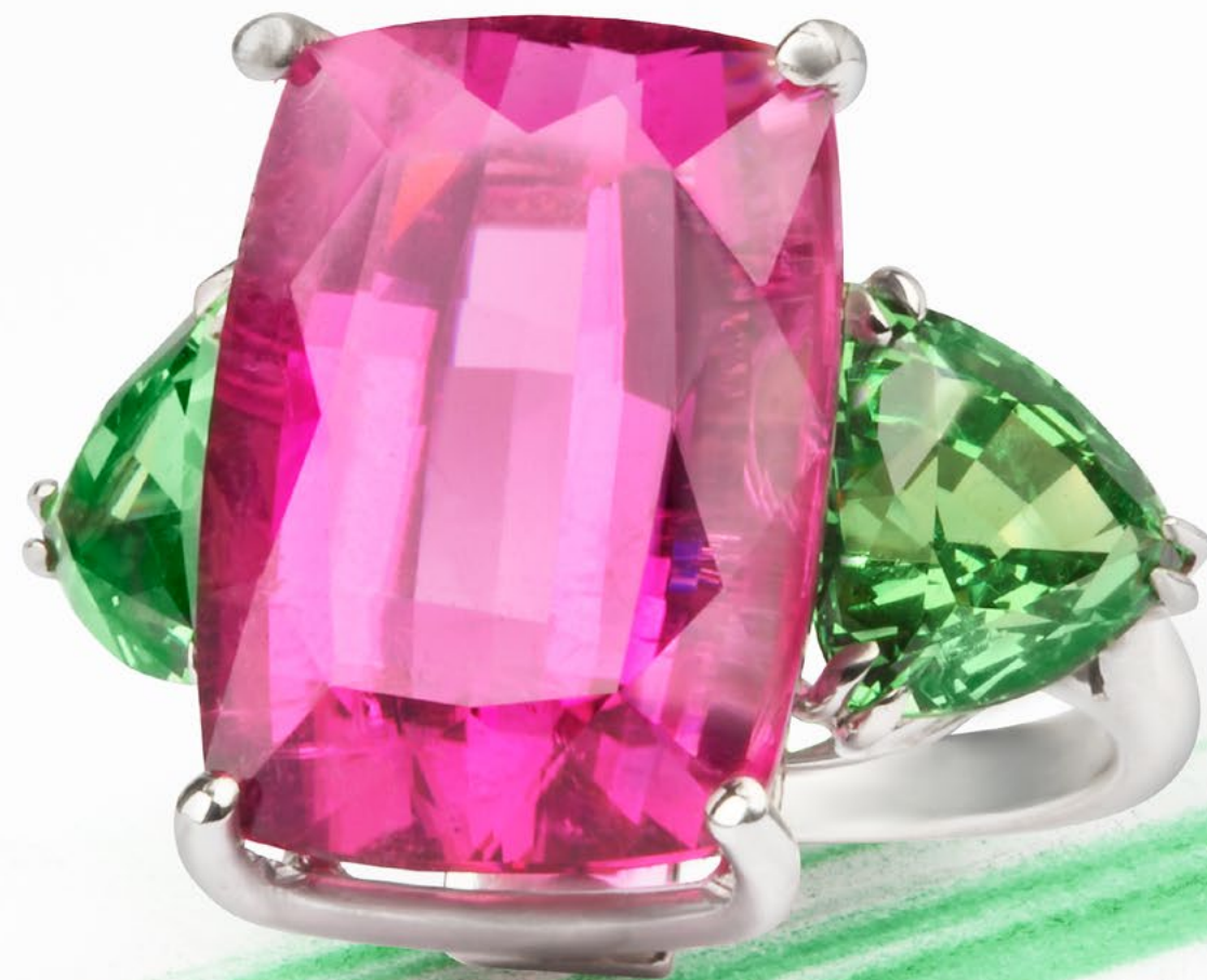
13.80ct Mozambique rubellite tourmaline ring set in platinum with 4.76ct Tanzanian tsavorite garnets