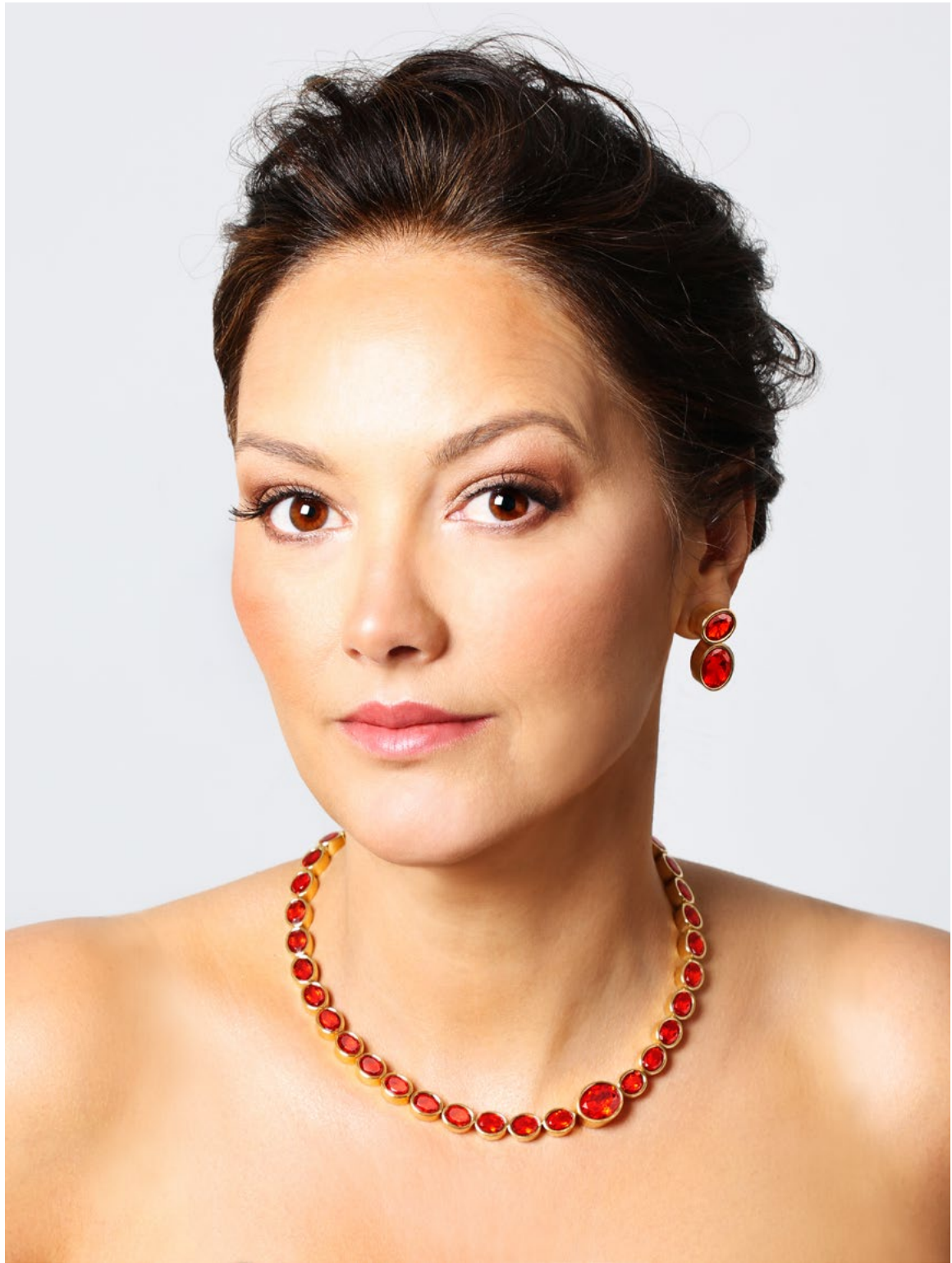
18 Collier necklace and earring set with spectacular faceted Mexican fire opals in 18k yellow gold