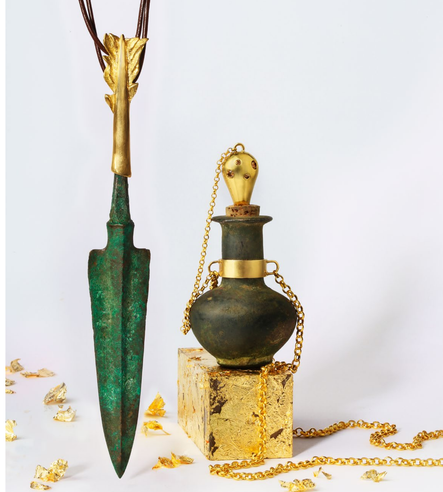
Roman arrowhead pendant with 20k gold spear tail and leather cord; 2000 year old Roman perfume bottle with 20k gold collar and bulb pin stopper with champagne diamonds suspended from a 24k gold chain