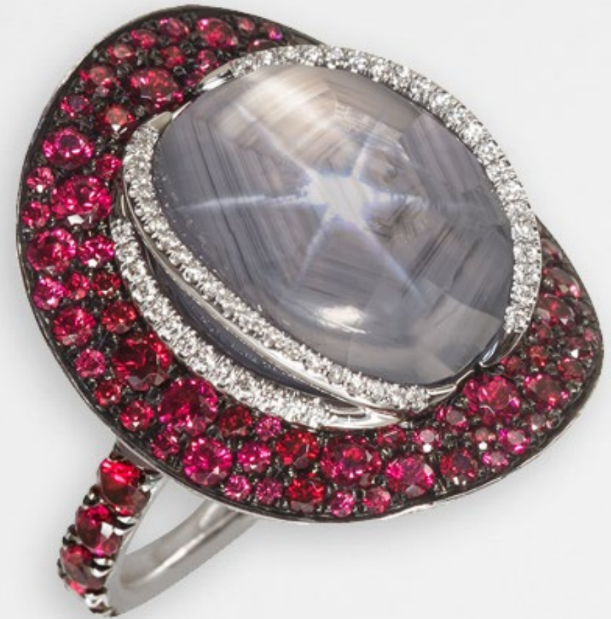
28.54ct Grey star sapphire ring with red spinel and diamond set in 18k white gold