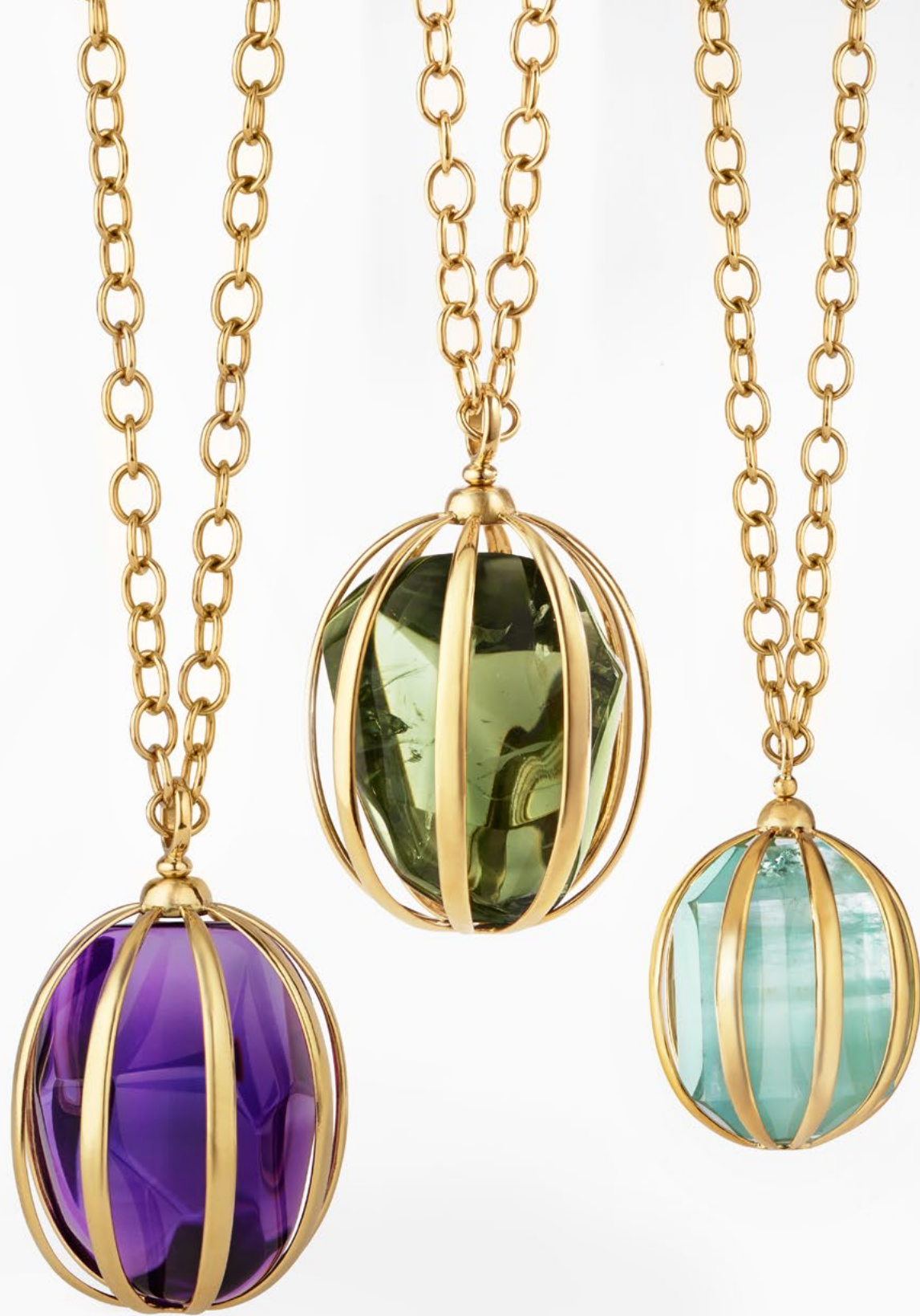
Cage pendant collection featuring freeform purple and green amethyst, and faceted aquamarine set in 18k yellow gold with interchangeable stones