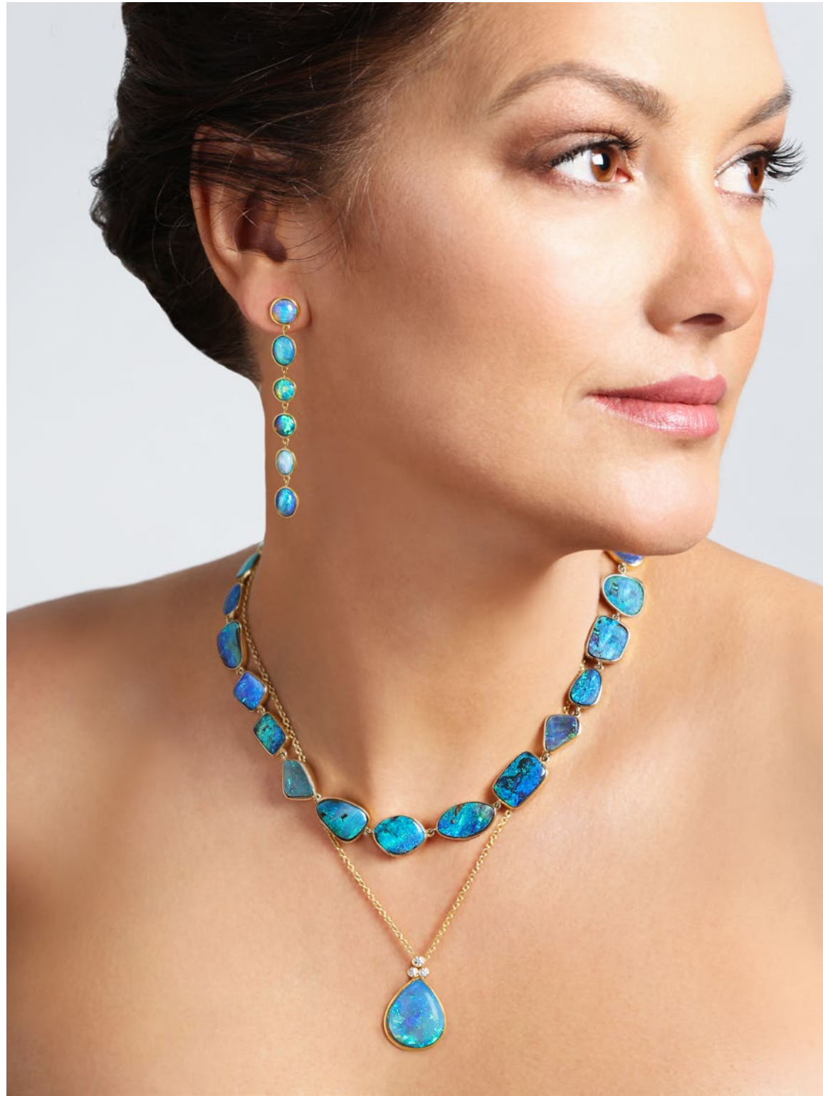
Collier necklace set with boulder opals in 18k gold and 8.27ct black opal drop pendant set with diamond accents and matching black opal drop earrings