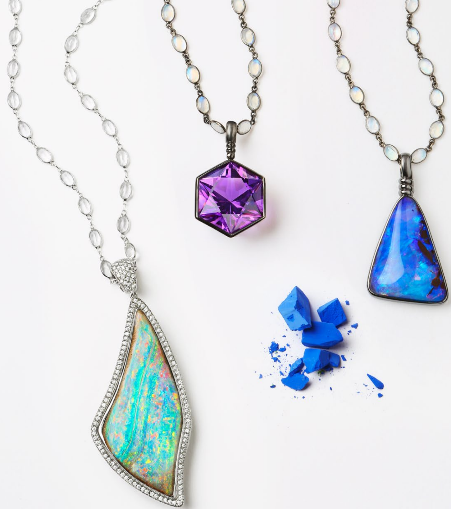
"Northern Lights" pendant II with 96.59ct boulder opal set in 18k white gold with diamonds on a custom white gold and topaz chain, 36.31ct hexagon amethyst pendant set in 18k white gold with black rhodium plating and custom moonstone chain; 34.90ct boulder opal set in 18k white gold with black rhodium plating and custom moonstone chain