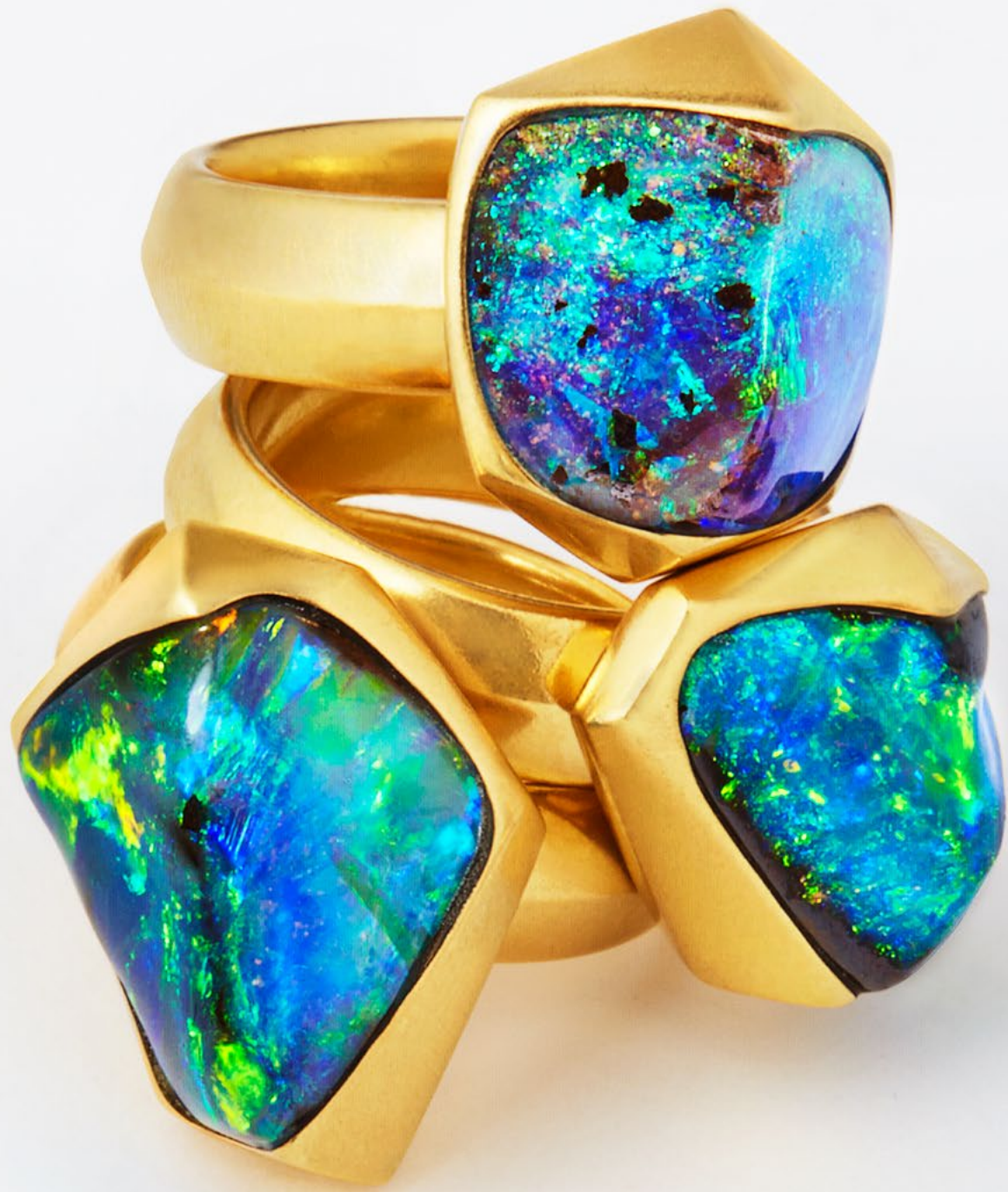
Pyramid stack rings including cubed boulder opals, asymmetrical tiger's eye and lapis set in 20k yellow gold