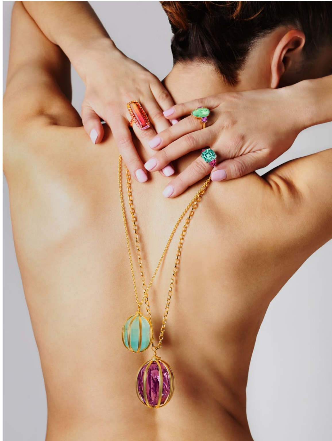
Cage pendants featuring freeform aquamarine and amethyst stones set in 18k gold with colorful gemstone rings