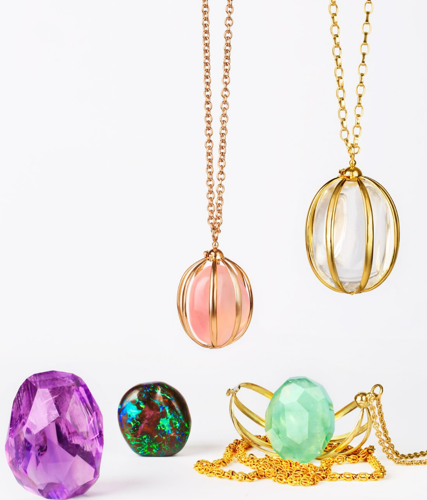
Freeform purple amethyst, boulder opal, rose quartz, quartz crystal and faceted aquamarine interchangeable stones with in 18k yellow gold cage pendant