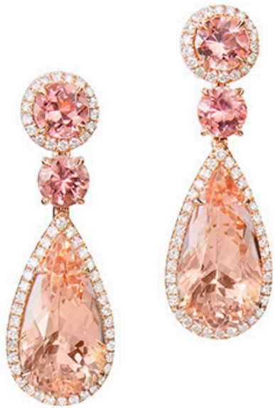
18K Rose Gold Earrings with Pink Tourmaline Tops in Diamond Frame, Pink Tourmaline Center Station and Morganite Pear Shape Drop in Diamond Frame