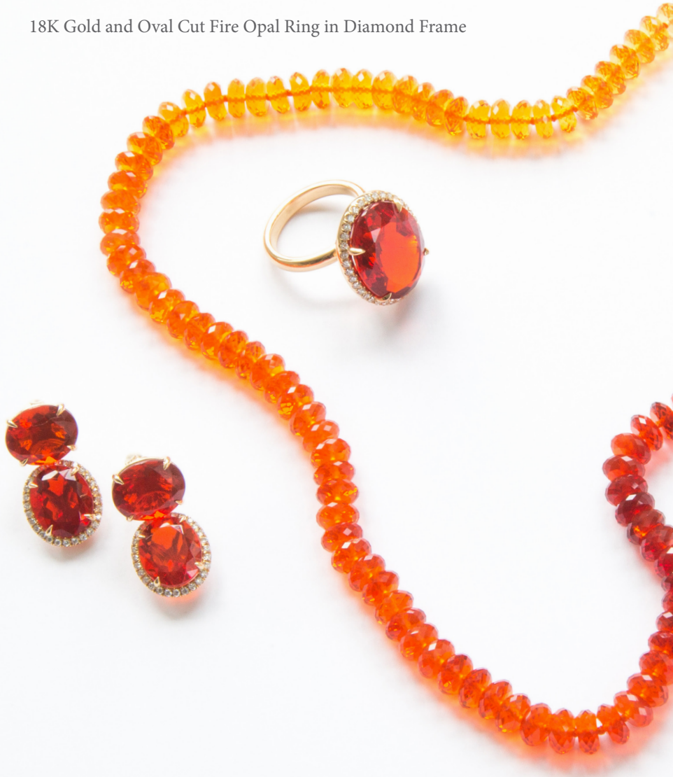
18K Gold and Oval Cut Fire Opal Ring in Diamond Frame