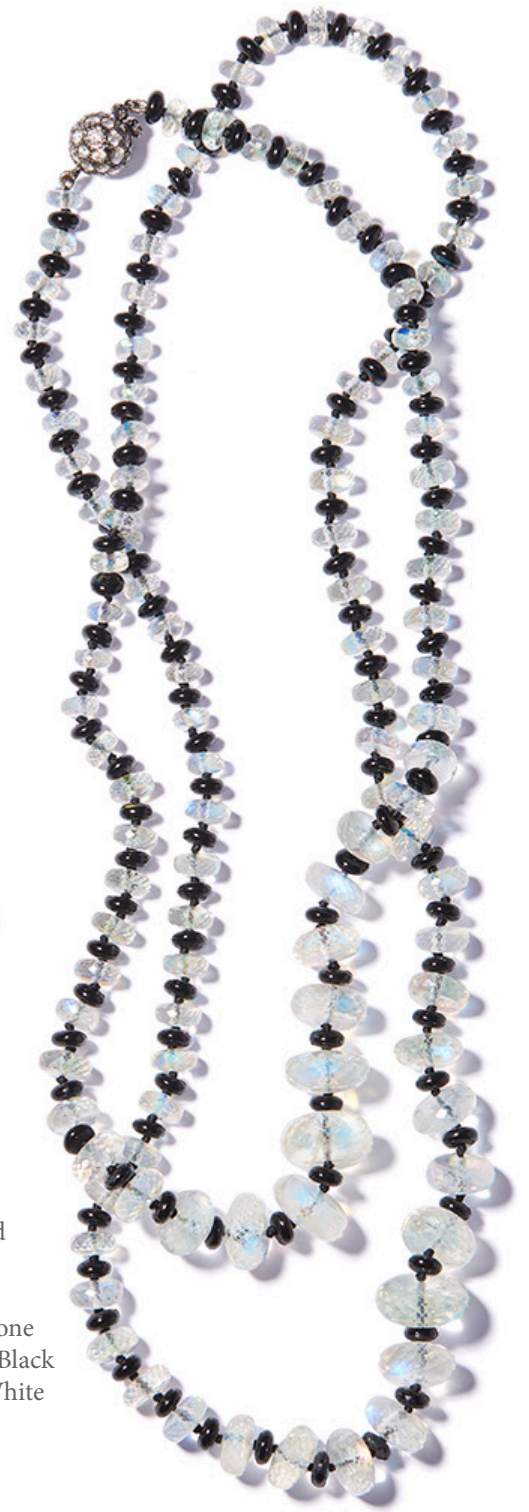
Faceted, Graduated Size Moonstone Bead Necklace with Alternating Black Onyx Roundel Beads and 18K White Gold and Diamond Ball Clasp