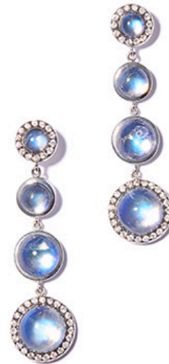
18K White Gold Four Drop Blue Moonstone Earrings in Diamond Frames