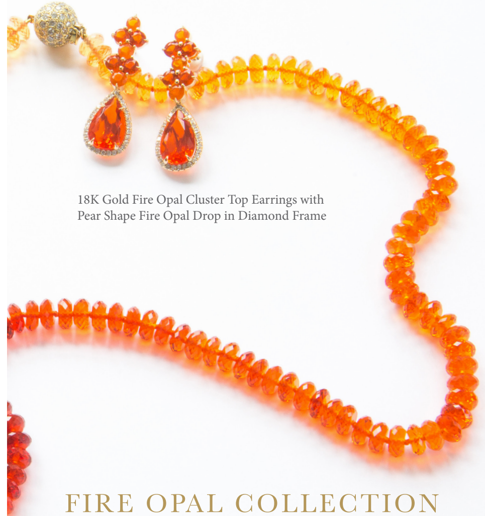
18K Gold Fire Opal Cluster Top Earrings with Pear Shape Fire Opal Drop in Diamond Frame