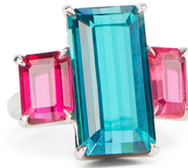
Platinum Ring with Emerald Cut Indicolite Tourmaline Center Stone Flanked by Emerald Cut Pink Spinel