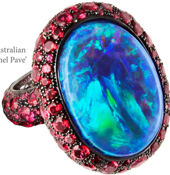
18K Darkened White Gold Australian Black Opal Ring with Red Spinel Pave' Frame and Band