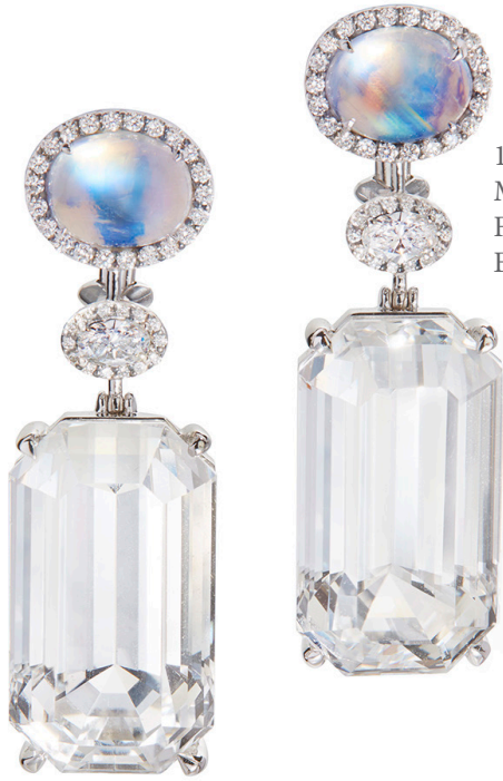
18K White Gold Earrings with Blue Moonstone Cabochon Tops in Diamond Frame, Diamond Center Station and Emerald Cut White Topaz Drops