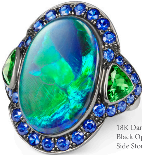
18K Darkened White Gold Australian Black Opal Ring with Tsavorite Trillion Side Stones and Blue Sapphire Frame