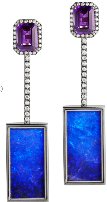
18K Blackened Gold Pendulum "Tick-Tock" Earrings with Emerald Cut Amethyst (2.5 ct) Diamond (.55 ct) Bar and Boulder Opal (24.76 ct) Rectangle Drops