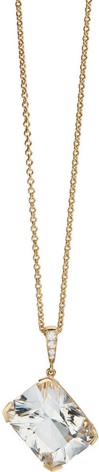
24" 18K Gold Chain Necklace with Emerald Cut Topaz Pendant with Diamond Bale