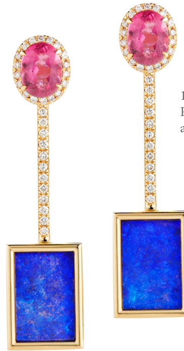
18K Gold Pendulum "Tick-Tock" Earrings with Oval Rubellite Tourmaline (2.5 ct) Diamond (.43 ct) Bar and Boulder Opal (13.31 ct) Rectangle Drops