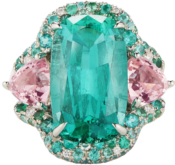
Platinum Green Beryl (15.22 ct) Ring with Morganite (3.66 ct) Trillion Side Stones and Paraiba Tourmaline (2.56 ct) and Diamond Pavé Accents