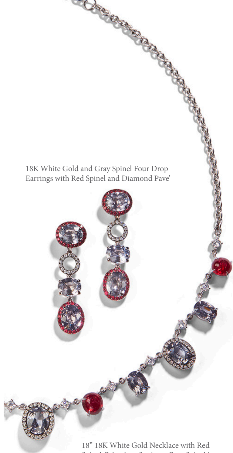
18" 18K White Gold Necklace with Red Spinel Cabochon Stations, Gray Spinel in Diamond Frame Stations