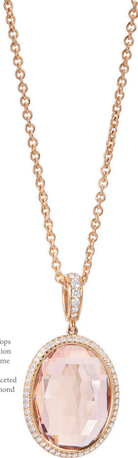
24" 18K Rose Gold Chain Necklace with Oval Faceted Morganite Pendant in Diamond Frame and Diamond Bale