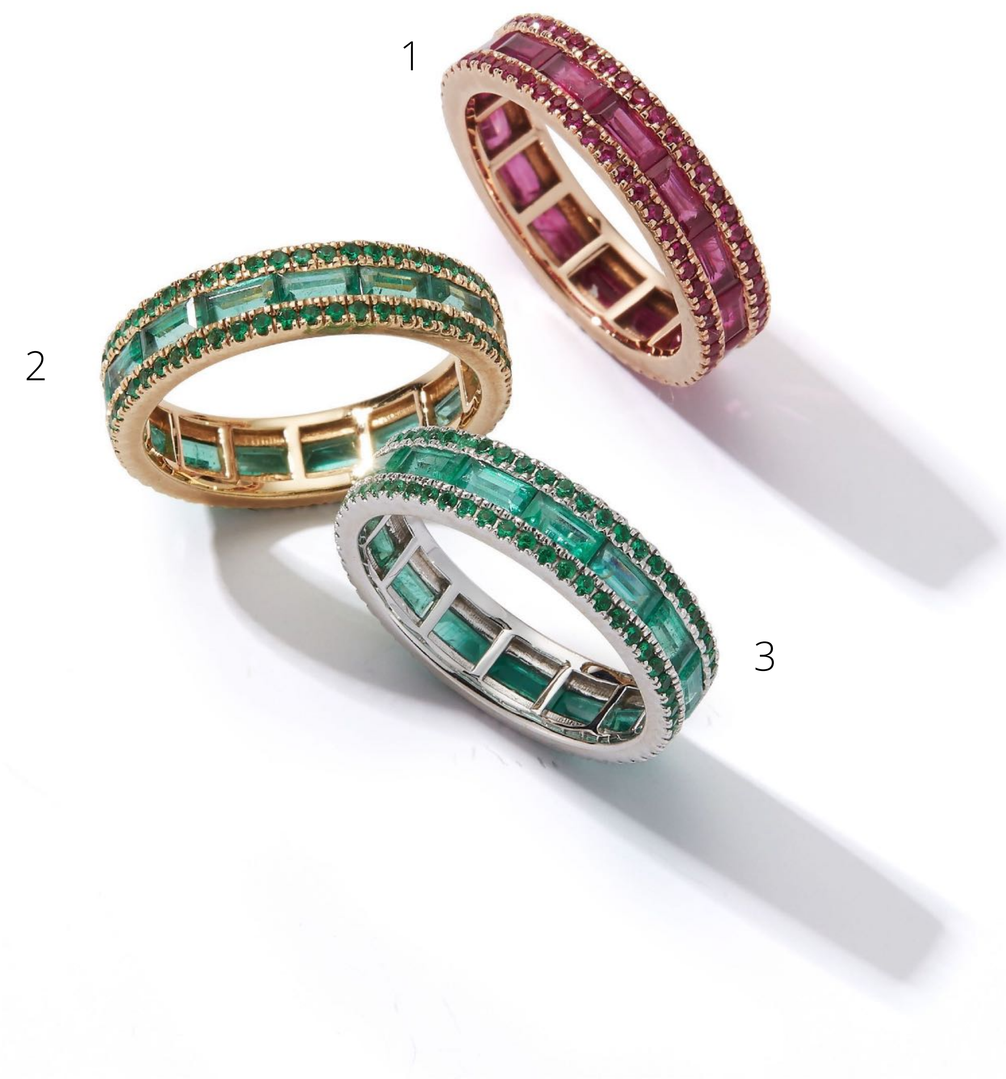
1 Hot Pink Sapphire Origami Stacking Band 3,900.00 USD 2/3 Emerald Origami Stacking Bands in White and Yellow Gold 8,800.00 USD