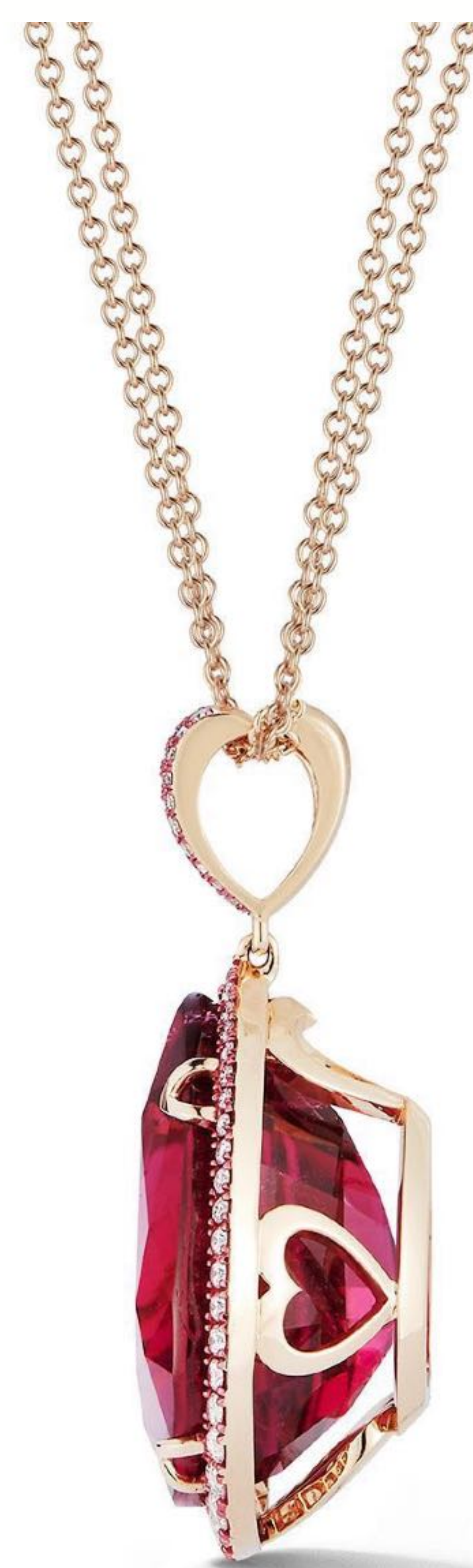
1 Rubellite and Diamond Necklace on Diamond Chain 68,000.00 USD