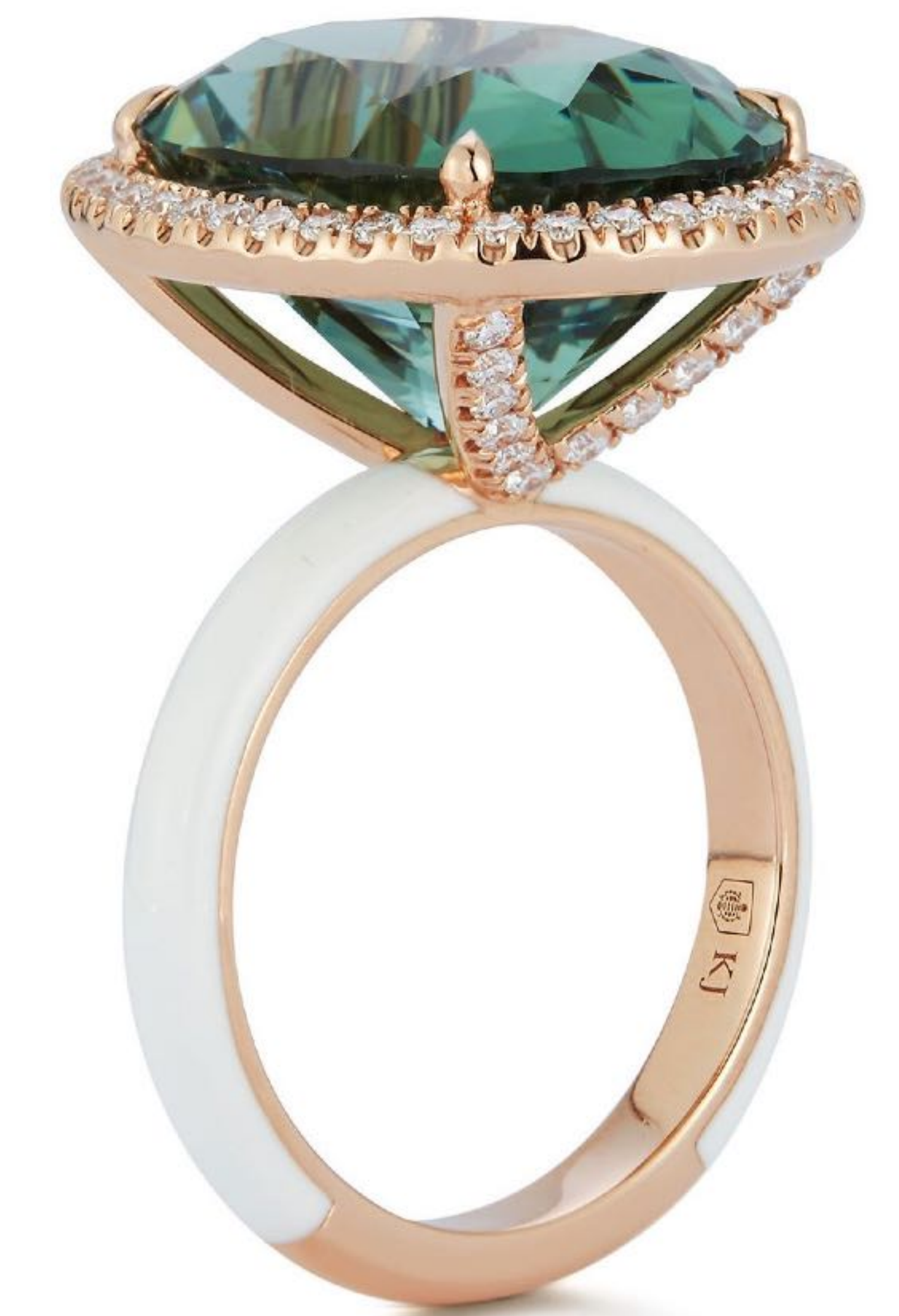
1 Oval Mint Green Tourmaline Cocktail Ring 21,500.00 USD