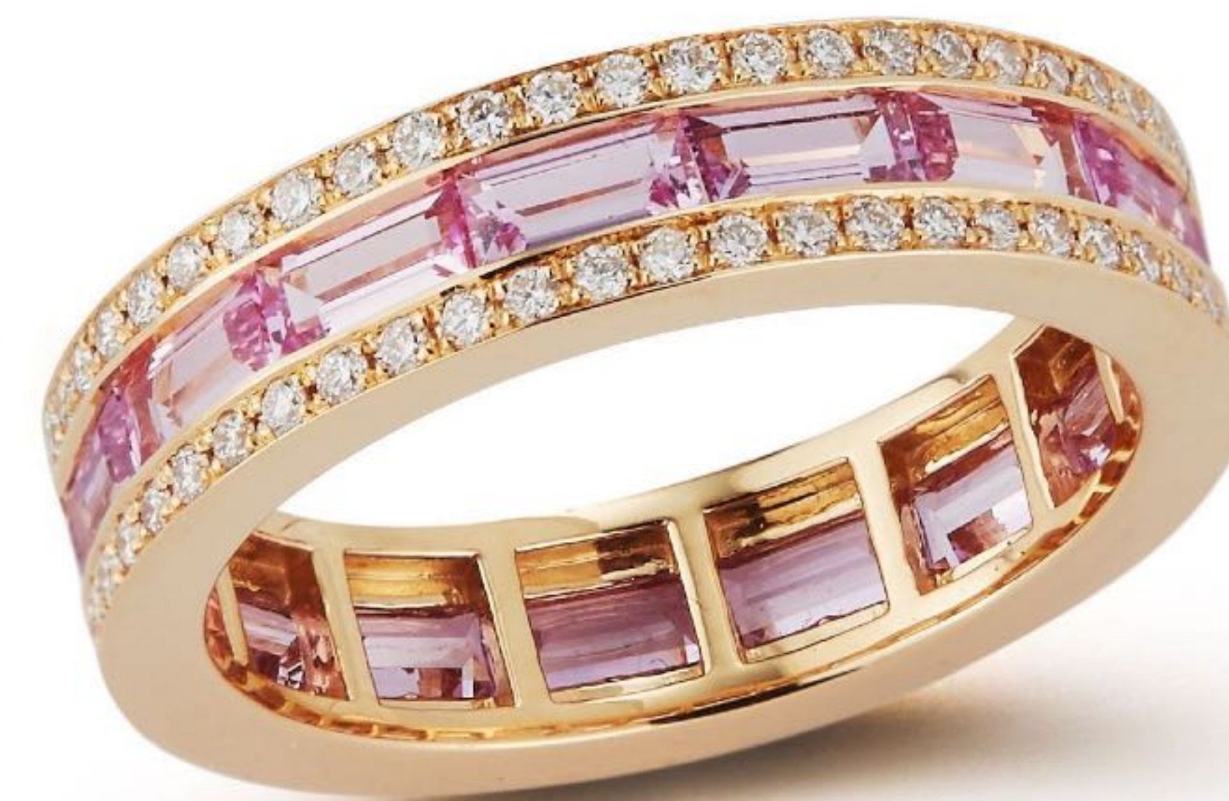
2 Light Pink Sapphire Ring 5,200.00 USD