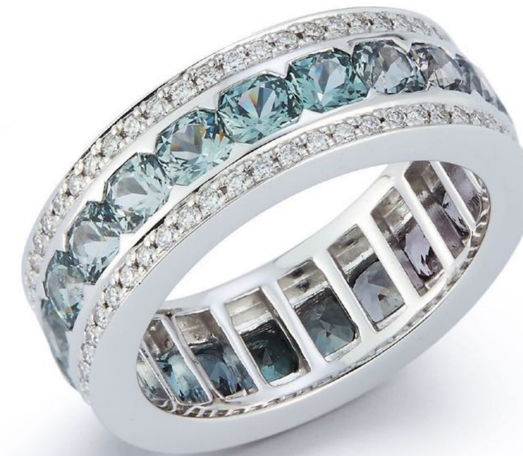
3 Purple Spinel & Diamond Origami Ring 5,500.00 USD