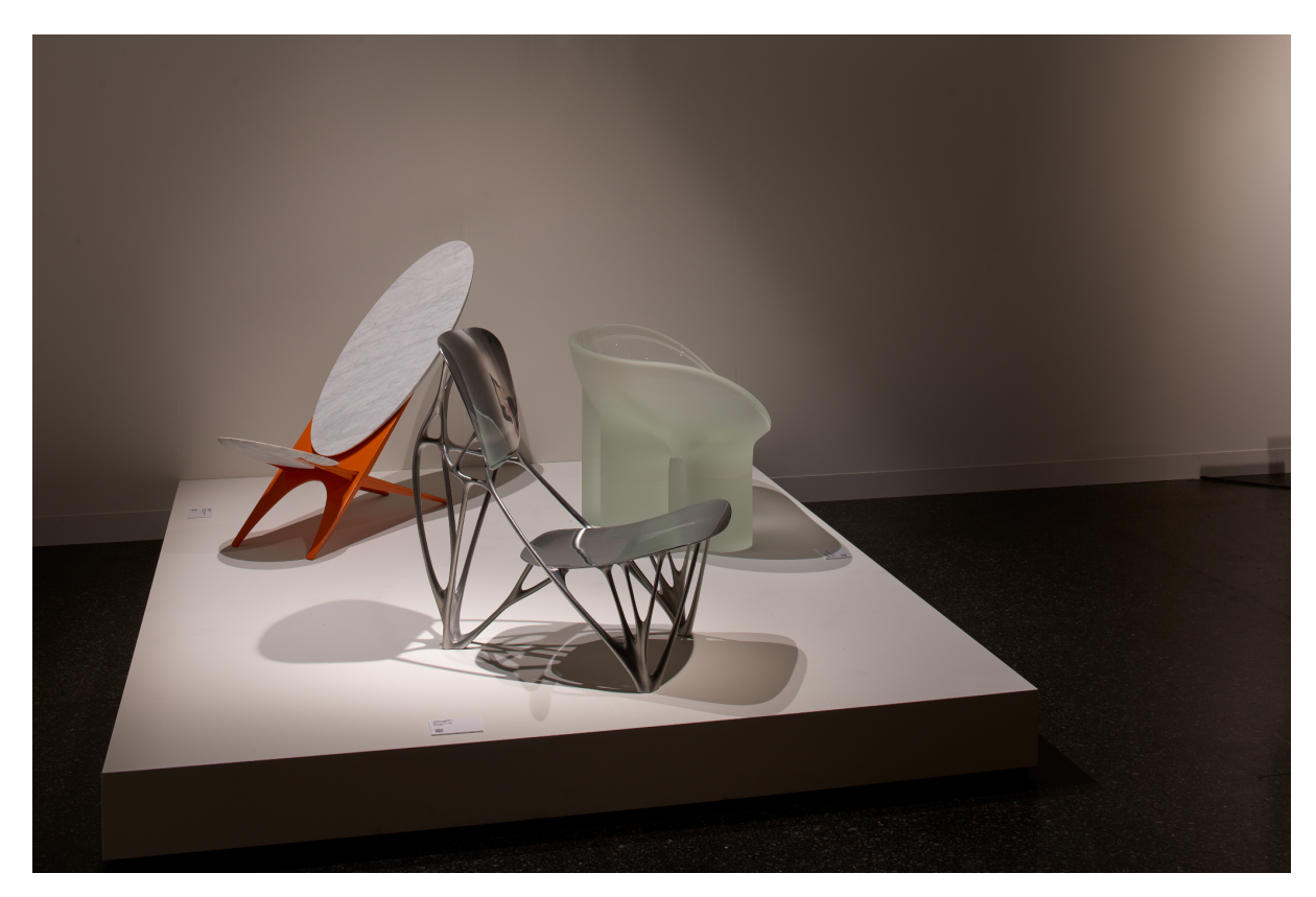
Friedman Benda at Design Miami/ Basel 2023.