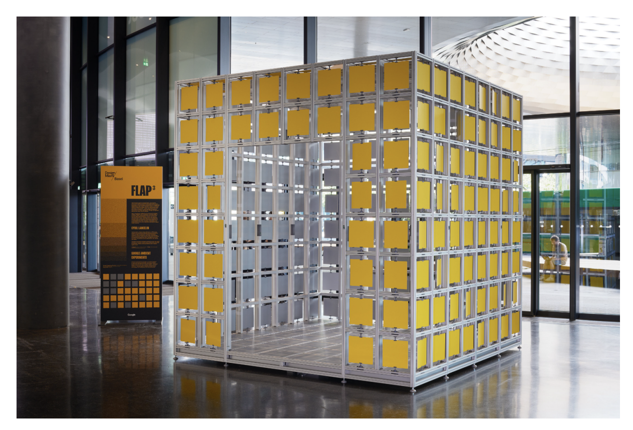
Flap<sup>3</sup> by Cyril Lancelin at Design Miami/ Basel 2023.