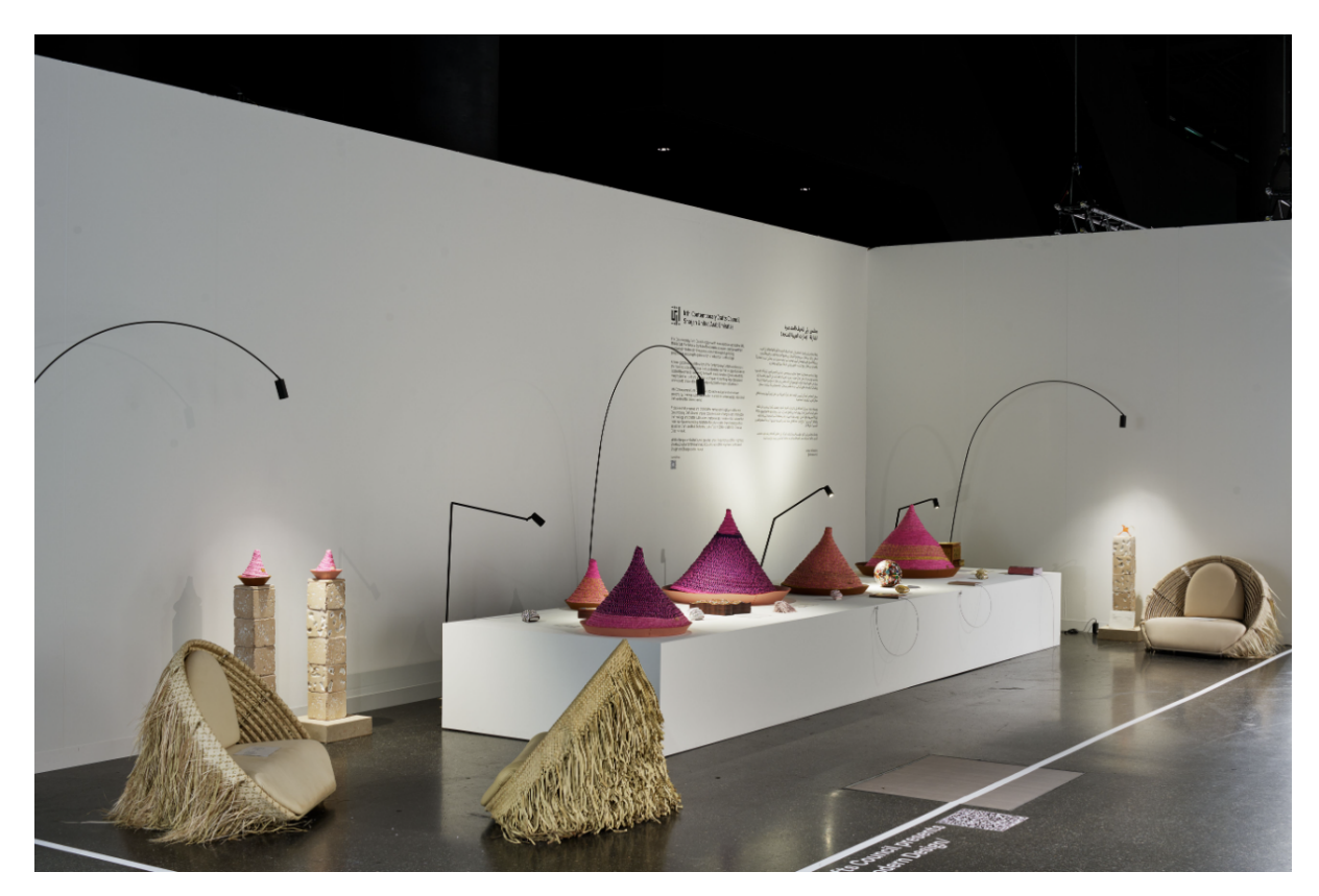
Irthi Contemporary Crafts Council at Design Miami/ Basel 2023.