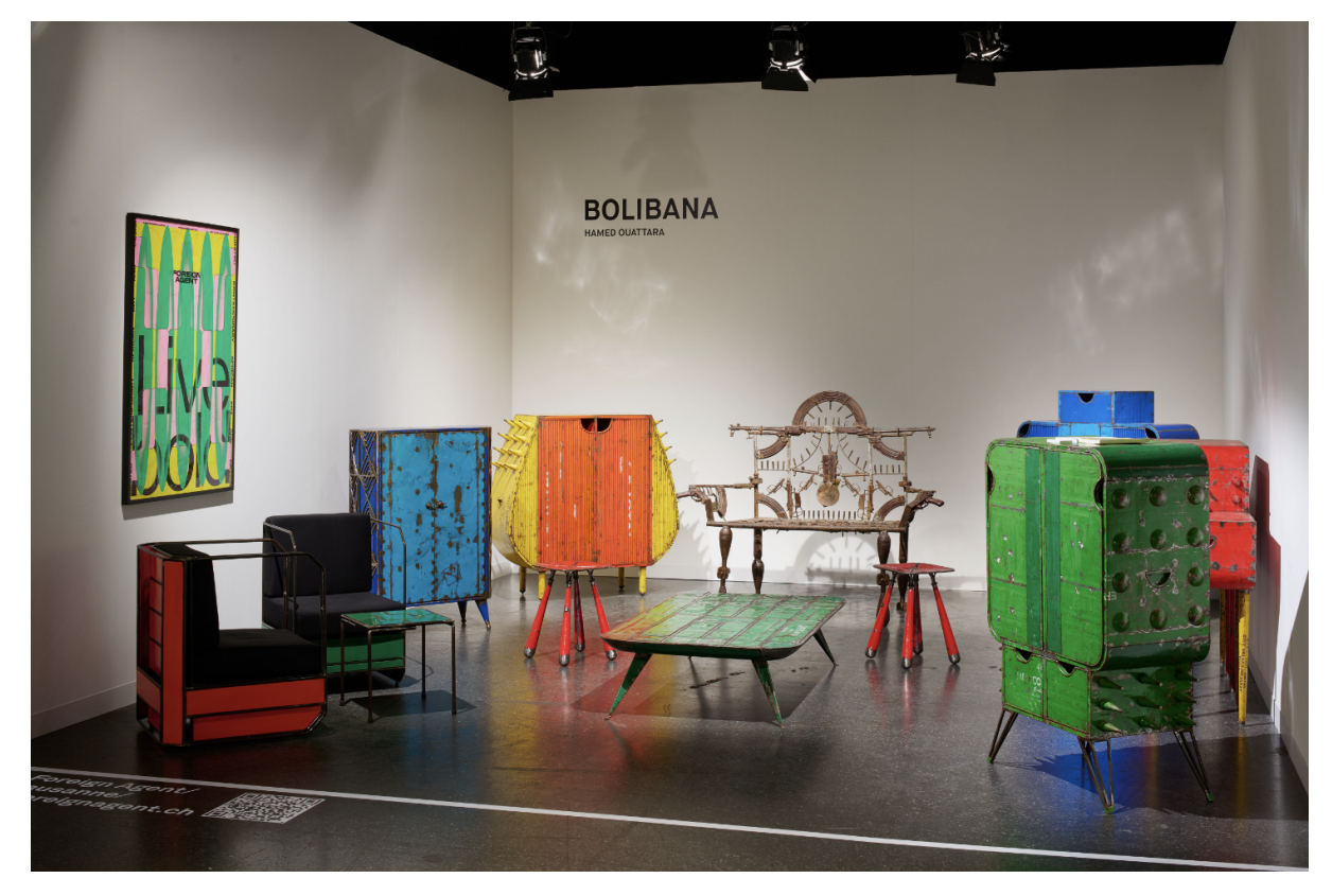
Foreign Agent at Design Miami/ Basel 2023.