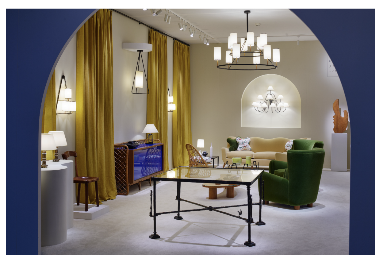
Galerie Jacques Lacoste at Design Miami/ Basel 2023.