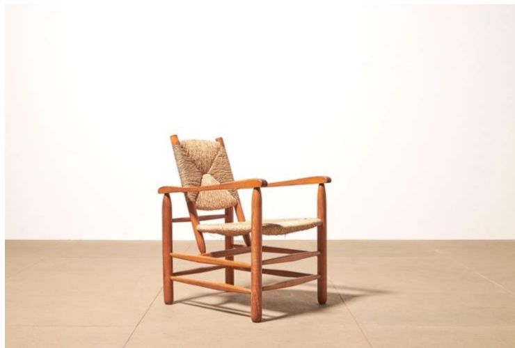
Laffanour – Galerie Downtown - Charlotte Perriand – 扶手椅 Laffanour – Galerie Downtown - Charlotte Perriand – rush armchair