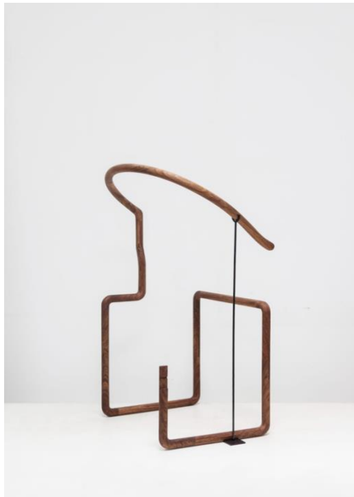
邵帆 – 老树椅