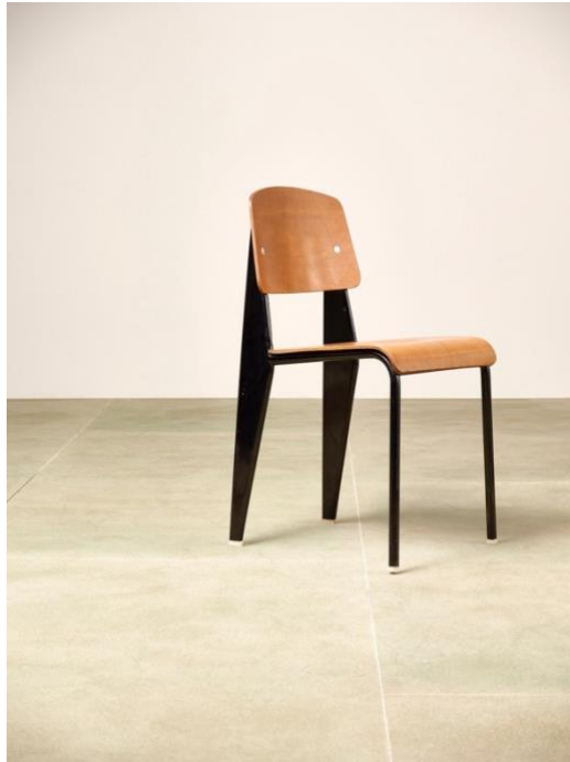
Laffanour – Galerie Downtown - Jean Prouvé – 椅子 Laffanour – Galerie Downtown - Jean Prouvé – standard chair