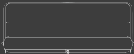
Lilo I Double