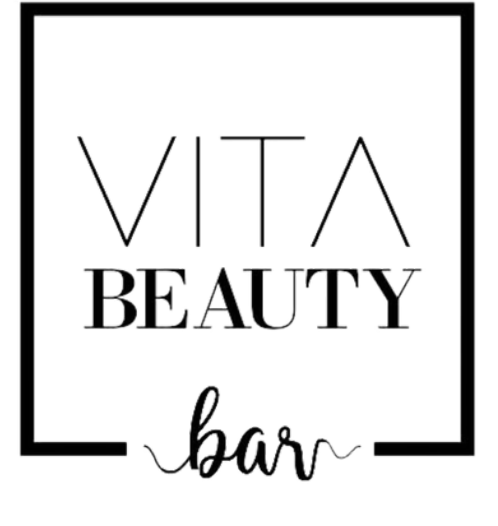
RESULT DRIVEN SERVICES