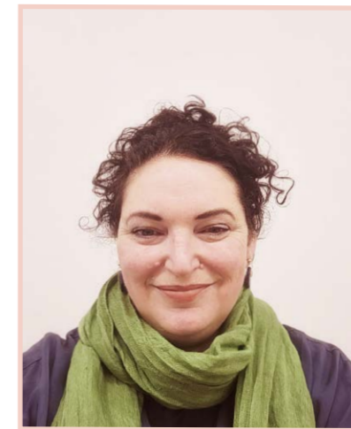
LOVE FROM KARILYN XX

Please remember that if you want to be in the draw to win a free Love From You Box, then share a video or pictures of unboxing the box on your social media, making sure you tag us (@lovefromyoubox) when you do. It's that easy!