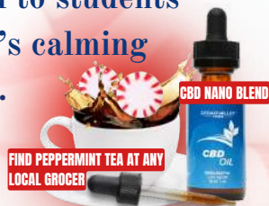
FIND PEPPERMINT TEA AT ANY LOCAL GROCER

MINTY MOMENT: Make a hot cup of peppermint tea or drop a couple peppermints into your favorite cup of coffee. Then, dispense our CBD Nano Blend into your drink. Enjoy decorating or holiday shopping with only the perfect ideas in mind!