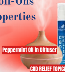
Peppermint Oil in Diffuser

when sick this season! MINTY MOMENT: Add peppermint essential oil to your diffuser and massage our Relief Topical on your chest for respiratory relief!