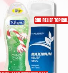
AMAZING, COST-EFFECTIVE BODY WASH OPTION - SOLD AT WALMART!

body wash. As you emerge from your steamy sanctuary, massage our CBD Relief Topical onto your neck and shoulders and send stress out with the snow.