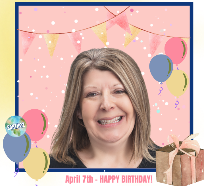
April 7th - HAPPY BIRTHDAY!