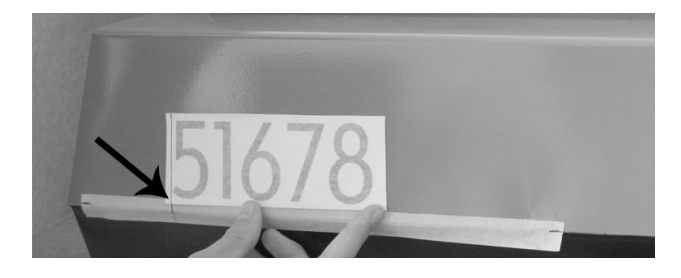
Step 5 - Peel of Backing

before the first number. Also, mark the first number position on the Guide Tape. Align.