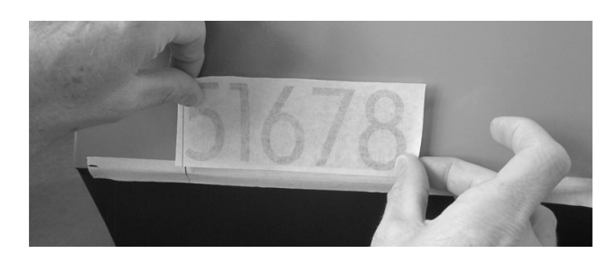
Step 7 – Smooth & Press Numbers Using a <u>plastic</u> squeegee, starting from the center smooth to the left edge. Then starting from the middle smooth to the right edge. Repeat 4-5 times. Try to avoid wrinkles or bubbles. Press firmly.

Hold two corners of the transfer film and align the bottom of the numbers with the top of the Guide Tape. Align the starting number position. Apply the transfer film with numbers to the mailbox.