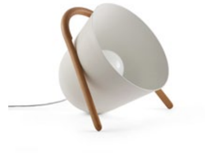
Elma designed by Tommaso Caldera