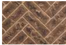
Tavern Brown Herringbone (single-sided only)