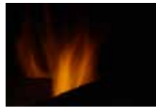
Reflective Black Glass (single-sided only)