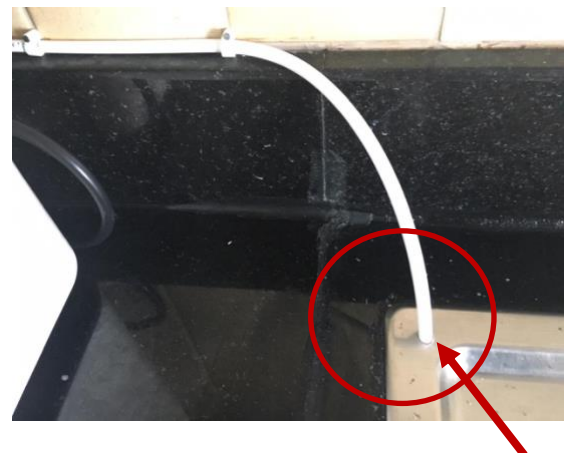
Exact size with the pipe, 1/4"