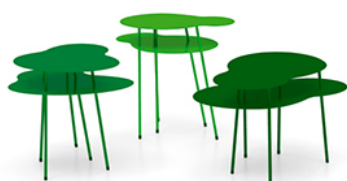
AMAZONAS Table By Claesson Koivisto Rune