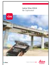
Leica Viva GS14