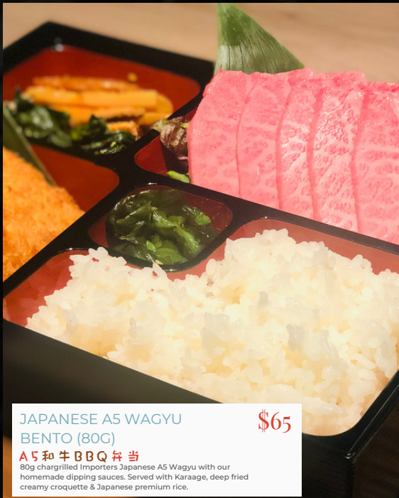
JAPANESE A5 WAGYU BENTO (80G) $65 A5和牛BBQ弁当 80g chargrilled Importers Japanese A5 Wagyu with our homemade dipping sauces. Served with Karaage, deep fried creamy croquette & Japanese premium rice.