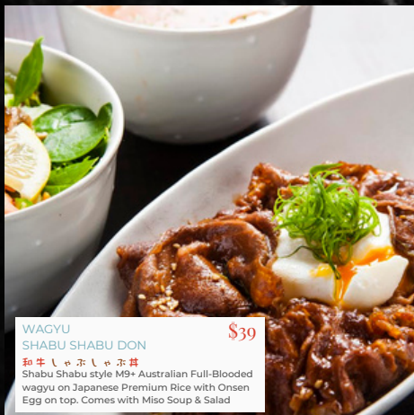
WAGYU SHABU SHABU DON $39 和牛しゃぶしゃぶ丼 Shabu Shabu style M9+ Australian Full-Blooded wagyu on Japanese Premium Rice with Onsen Egg on top. Comes with Miso Soup & Salad