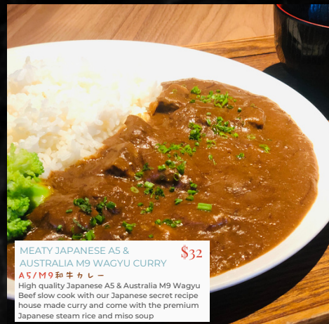
MEATY JAPANESE A5 & AUSTRALIA M9 WAGYU CURRY $32 A5/M9和牛カレー High quality Japanese A5 & Australia M9 Wagyu Beef slow cook with our Japanese secret recipe house made curry and come with the premium Japanese steam rice and miso soup