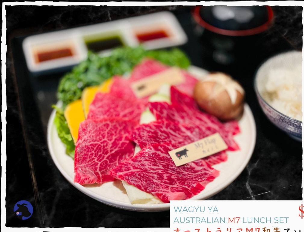
WAGYU YA AUSTRALIAN M7 LUNCH SET $35 | pp オーストラリアM7和牛ていしょく Combination of our best Australian M7 Wagyu