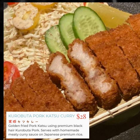
KUROBUTA PORK KATSU CURRY $28 黒豚カツカレー Golden fried Pork Katsu using premium black hair Kurobuta Pork. Serves with homemade meaty curry sauce on Japanese premium rice.