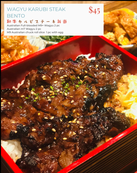
WAGYU KARUBI STEAK BENTO $45 和牛カルビステーキ弁当 Australian Full-blooded M9+ Wagyu 2 pc Australian m7 Wagyu 2 pc M9 Australian chuck roll slice 1 pc with egg