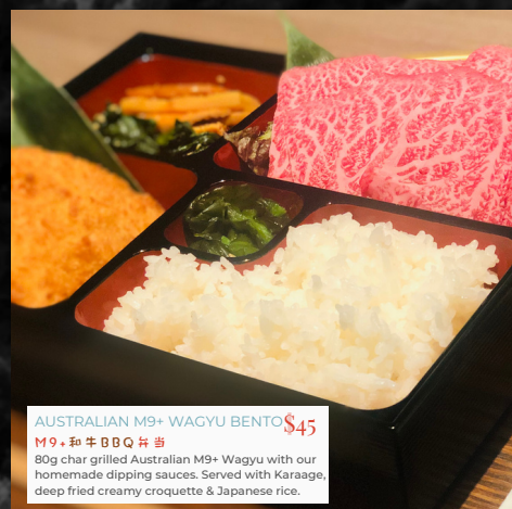
AUSTRALIAN M9+ WAGYU BENTO $45 M9+和牛BBQ弁当 80g char grilled Australian M9+ Wagyu with our homemade dipping sauces. Served with Karaage, deep fried creamy croquette & Japanese rice.