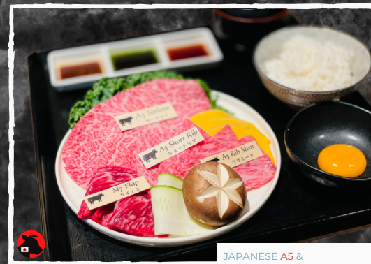
JAPANESE A5 & AUSTRALIAN M7 LUNCH SET $95 | pp A5|M7和牛ていしょく Combination of Japanese A5 Wagyu Australian M7 Wagyu & A5 Sirloin Slice