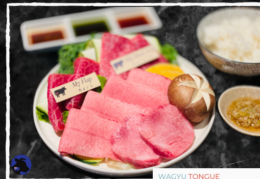
WAGYU TONGUE LUNCH SET $43 | pp 和牛クンていしょく Combination of Wagyu Tongue thin cut, thick cuts, Australian M9+ Full-blooded Wagyu & M7 Australian Wagyu