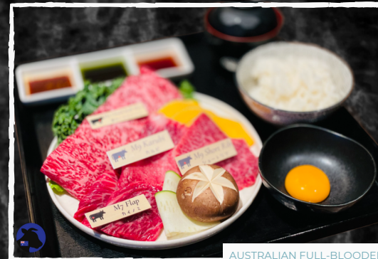
AUSTRALIAN FULL-BLOODED M9 | M7 LUNCH SET $43 | pp オーストラリアM9|M7和牛ていしょく Combination of Australian Full-blooded M9+ Wagyu Australian m7 Wagyu & M9 Australian chuck roll slice