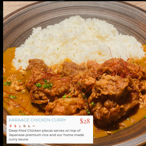
KARAAGE CHICKEN CURRY $28 チキンカレー Deep fried Chicken pieces serves on top of Japanese premium rice and our home made curry sauce.