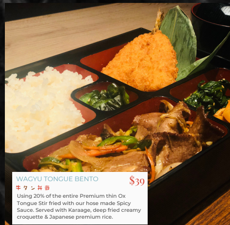
WAGYU TONGUE BENTO $39 牛タン弁当 Using 20% of the entire Premium thin Ox Tongue Stir fried with our house made Spicy Sauce. Served with Karaage, deep fried creamy croquette & Japanese premium rice.