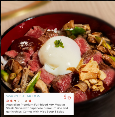
WAGYU STEAK DON $45 和牛ステーキ丼 Australian Premium Full-blood M9+ Wagyu Steak, Serve with Japanese premium rice and garlic chips. Comes with Miso Soup & Salad