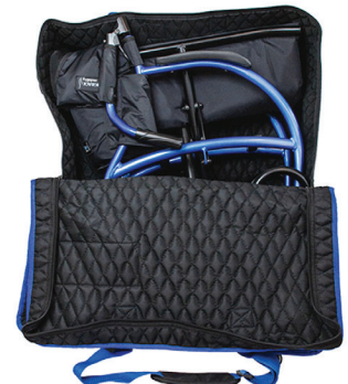
STRONGBACK Travel Bag

This quarter, we're excited to introduce the latest addition to our STRONGBACK product line - the STRONGBACK Cane Holder. It is designed with convenience in mind, offering effortless, tool-free assembly and constructed from durable, lightweight plastic. The two-piece set includes a removable insert, accommodating various cane sizes with diameters up to 1 inch, ensuring a secure hold. Whether it is preferred on the side or back, the universal design seamlessly fits most wheelchairs, transport chairs, and rollators, making it a versatile and practical accessory for your mobility aid.