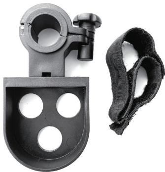
STRONGBACK Cane Holder

Accessories Aren't a MUST but Make Wheelchair Life Easier