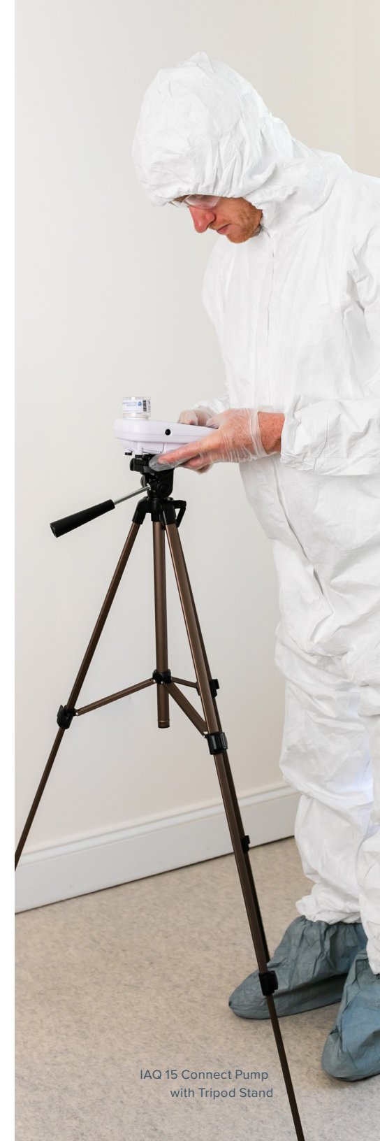
IAQ 15 Connect Pump with Tripod Stand

For more information, contact your local Environmental Express sales rep or call 1.800.343.5319 .