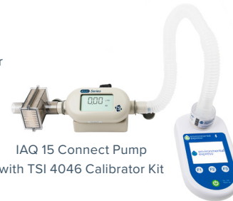
IAQ 15 Connect Pump with TSI 4046 Calibrator Kit