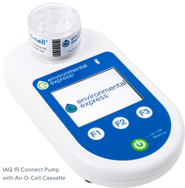
IAQ 15 Connect Pump with Air-O-Cell Cassette

Each IAQ 15 Connect Kit includes an IAQ 15 Connect pump, 10 Air-O-Cell cassettes, an Air-O-Cell air flow indicator, battery pack, battery cover key, AC power adapter, and carrying case.