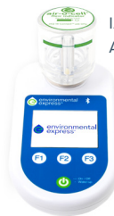
IAQ 15 Connect Pump with Air-O-Cell Air Flow Indicator