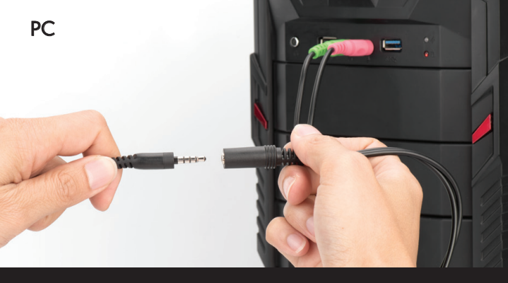
PC's with Mic & Audio ports will require a PC splitter cable.