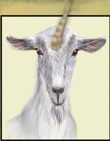
Notable Horn Alexander the Great (v21)