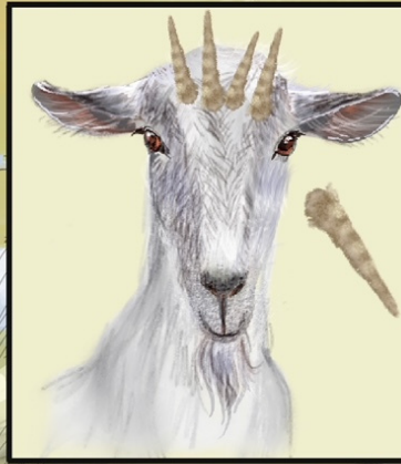
Little Horn of Goat v9 King of Fierce Countenance (V23)