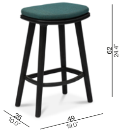
Counter stool - 61 FUR0001363