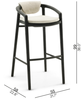
Barstool - 79 FUR0005006