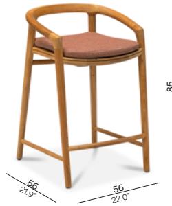
Barstool - 61 FUR0001364