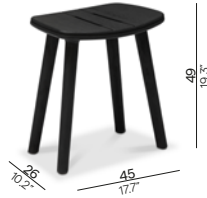
Stool - 47 FUR0001362