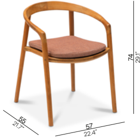
Dining arm chair FUR0000227