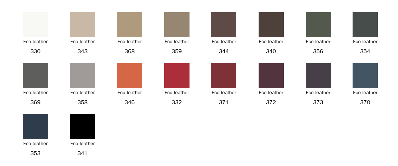
Fabric - Special