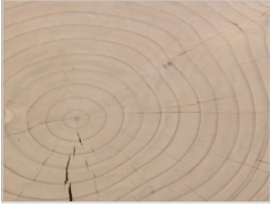
cedarwood contract finish