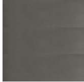
OP0 transparent varnished