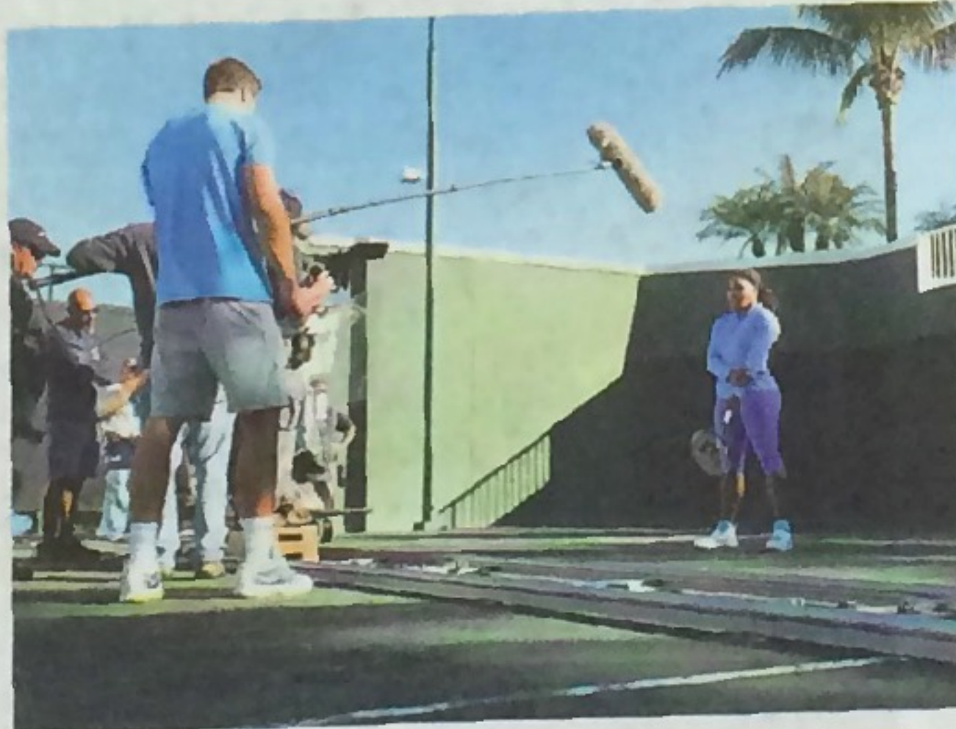
Serena Williams creating her two-hour MasterClass tennis video in Florida.