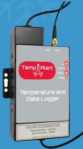
Temperature Data Logger