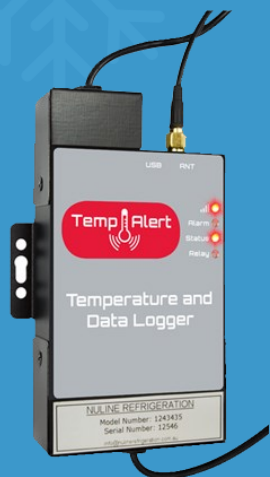
Temperature Data Logger