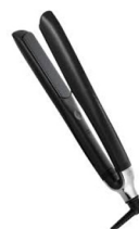
Style & Maintain