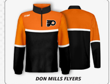
DON MILLS FLYERS