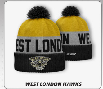
WEST LONDON HAWKS