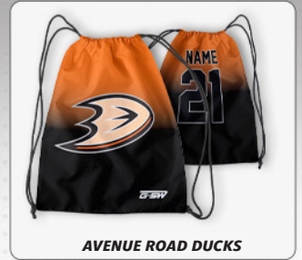
AVENUE ROAD DUCKS