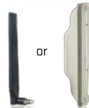
One Indoor Antenna