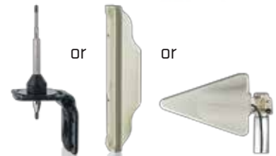
One Outdoor Antenna