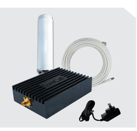
Option: 4G LTE with Omni Antenna