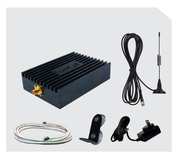
4G LTE with Suction-mount Antenna

Model SC-SOLOAI-15 for AT&T with Suction Mount Antenna Model SC-SOLOVI-15 for Verizon with Suction Mount Antenna Model SC-SOLOAI-15-O for AT&T with Omni Antenna Model SC-SOLOV-15-O for Verizon with Omni Antenna