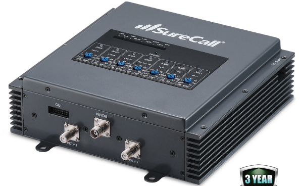
The SureCall Fusion7 signal booster