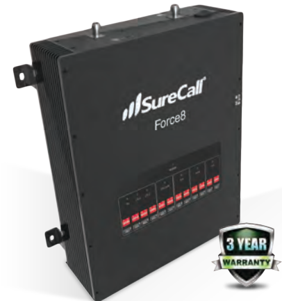
The SureCall Force8 Industrial Amplifier

* Performance and coverage area are dependent upon the strength of cell signal outside of the building and density of structure and materials inside of the building.