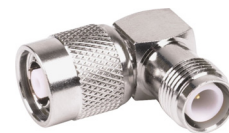
RA RPTNC Jack (F) to RPTNC Plug (M)