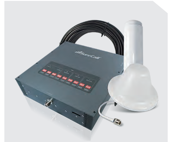
The SureCall Force5 kit featuring the Omni and dome antennas.