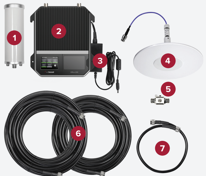
Items shown are for the Office 200 50 Ohm