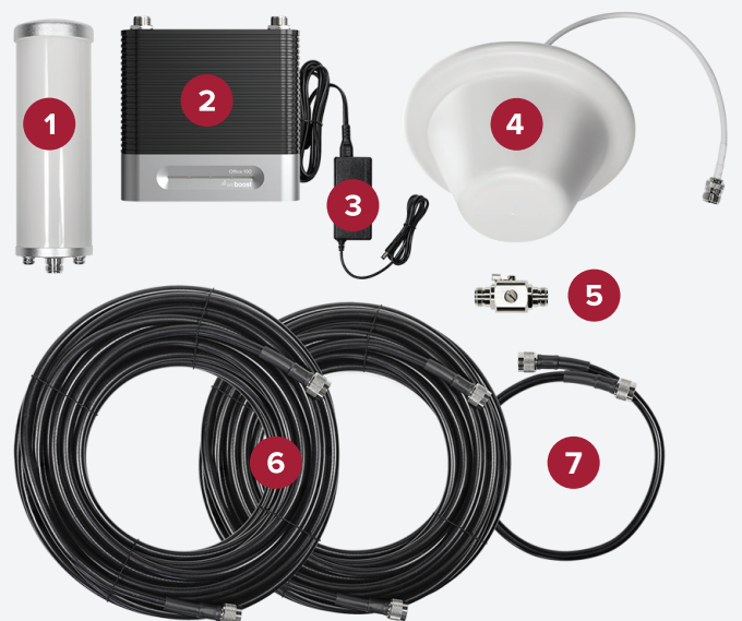
Items shown are for the Office 100 50 Ohm