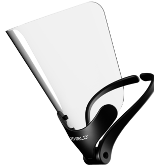
Assembled Shield: Active State