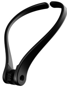
Neck Mount Dimensions: 4.18" x 4.2" x 1.4"