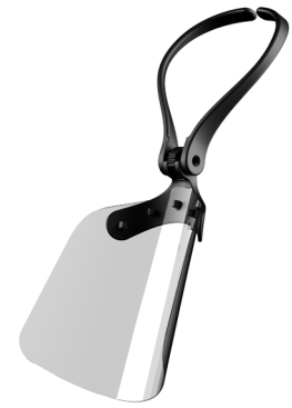
Assembled Shield: Idle State