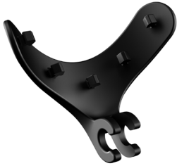
Shield Bracket Dimensions: 3.68" x 1.37" x 2.86"