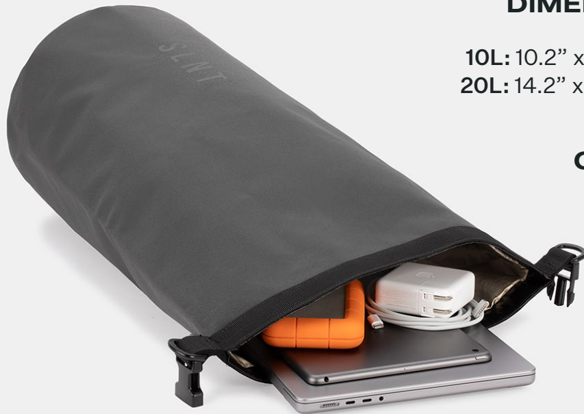
20L - Black