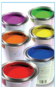
Paint & Ink