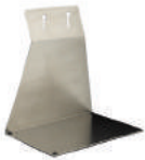
A813 Table Top Stand †