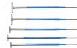
Lletz Loop Electrodes †