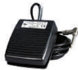
A803 Footswitch †