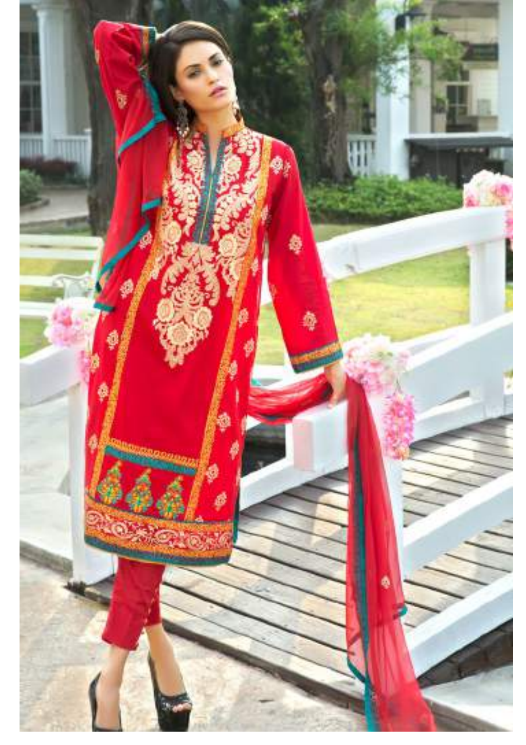
Be bold with this Red Dress This embroidered is the perfect dress to channel your personality and attitude. It features an embroidered crinkle dupatta. Add accessories and pair this with heels for a gorgeous look.