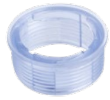
Clear Flush Fitting