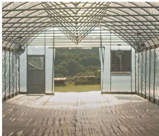
Finished Roll Up Door